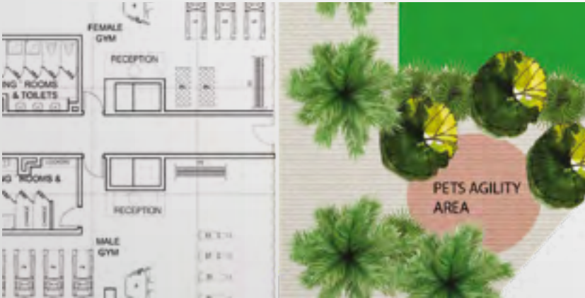
Extracted from the concept design idea

Our pet play area gives man's best friends the opportunities to exercise their growing minds and bodies outside