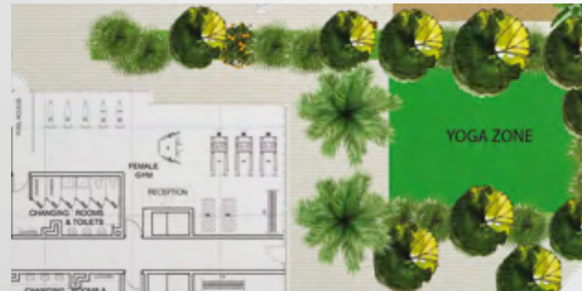
Extracted from the concept design idea

India may be the home of yoga, but right now Dubai is among the world's greatest hubs for this super-healthy practice. Of course it's not surprising that you can find so many different styles of yoga in Dubai, but the city has a reputation for diversity to uphold. There truly is something for everyone and anyone, even those who prefer to take outdoor fitness classes can try outdoor yoga at Azizi Riviera. It will change your life!