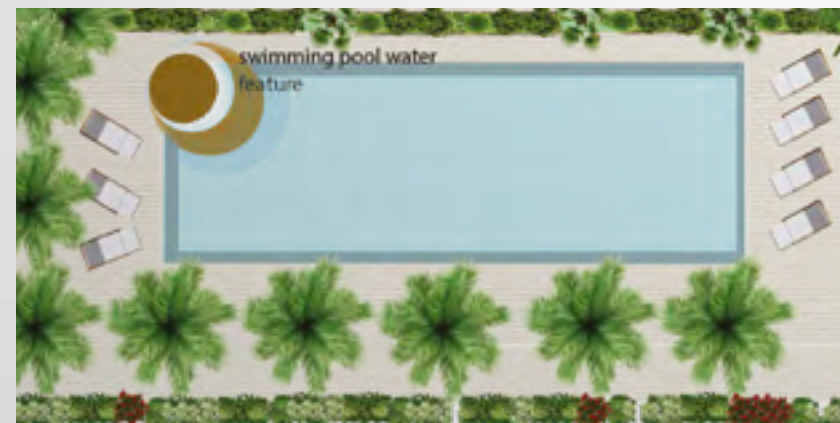
Extracted from the concept design idea

Sitting lazily next to the beautiful pool and sipping away at your favourite beverage is one of the first images that comes to mind when one thinks about lovely holidays. Swimming pools have become synonymous with relaxation and rejuvenation. Azizi Riviera will take this amazing outdoor experience a notch higher with a stunning waterfall feature that promises to take your breath away.