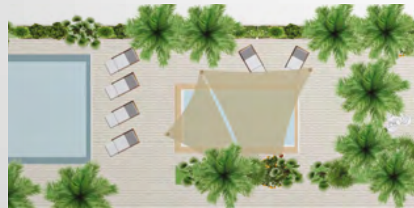
Extracted from the concept design idea

Just like anything else, swimming pools come in all different designs, sizes, shapes and are used for various purposes. Azizi Riviera has a shaded swimming pool to keep your kids engaged and entertained when the sun is shining and the weather is hot.