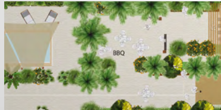
Extracted from the concept design idea

Live the ultimate lifestyle in Dubai. High up on your own rooftop terrace, you are easily able to entertain guests or relax alone on a sun-lounger.