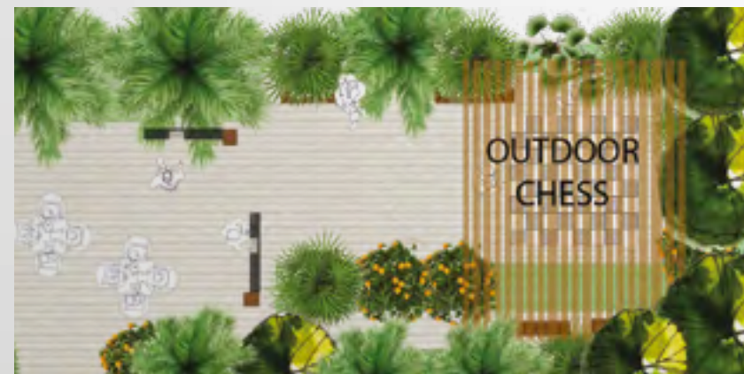
Extracted from the concept design idea

A timeless game enjoyed by all generations. You don't need backyards or large patios, the possibilities are endless at Azizi Riviera.