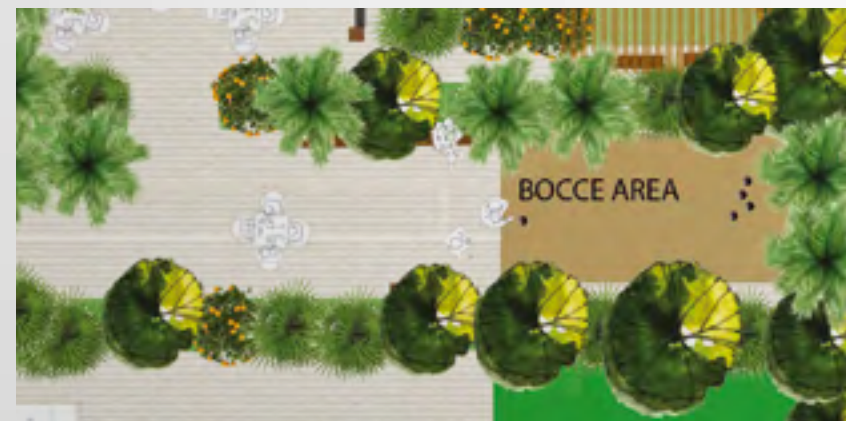
Extracted from the concept design idea

Bocce is loved by people of all ages. Competitors or teams lob a total of eight bocce balls as close as possible to a smaller white ball called the 'pallino.' It is estimated that the game originated in 5200 B.C. It is still played today all over the world - the second most played ball sport behind soccer. Azizi Riviera is the best place to play bocce in the Meydan area.