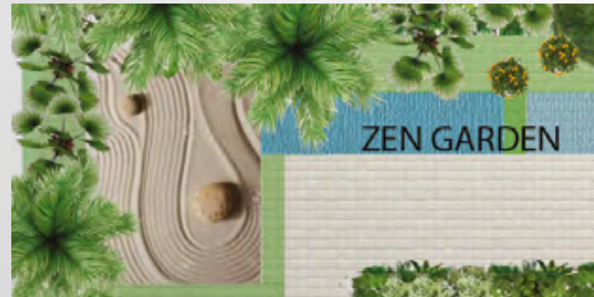
Extracted from the concept design idea

The sand or gravel in a Zen garden represent the sea or ocean and is used instead of water. Azizi Riviera Zen garden is carefully designed to create the impression of waves on the surface of a body of water. The rocks themselves represent islands or rock formations jutting out from the water.